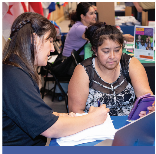
Indiana Learns community outreach.

The grandmother makes the drive from Gary to Merrillville three times per week to get him the help he needs at a Sylvan Learning Center, a private tutoring site that otherwise would've been out of their financial reach. Once the family used their $1,000 grant, she was able to replenish it to support his continued progress, and Sylvan invested in their efforts by offering a discounted hourly tutoring rate. The grandson is seeing improved grades and not acting out as much in school.<sup>72</sup>