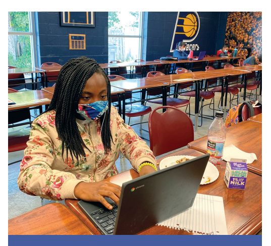
A Community Learning Site at Hawthorne Community Center in Indianapolis.

Experts point to two different approaches that could help achieve this kind of customization at the scale needed to serve all students.