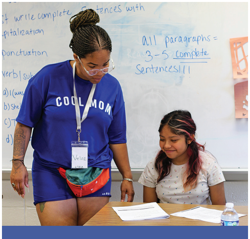
LaPlaza's Indy Summer Learning Labs site.

During the morning academic period, a peek inside a primary grade classroom revealed a group of students sounding out words phonetically as they competed for points by getting the correct spelling of similar-sounding words, such as "sheep" and "cheat." A few doors down, laughter erupted from a classroom as older students huddled around a table with their smiling teacher, sharing stories in Spanish.