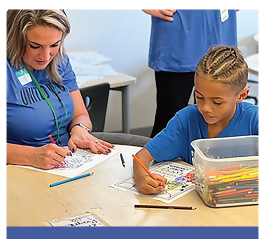
Boys & Girls Clubs of St. Joseph County.

The organization recently reimagined its teen center to serve as a "workforce development hub," where students